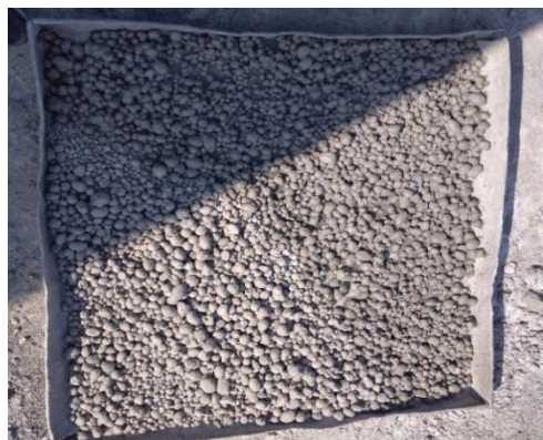
Fig 2. Drying of aggregate

The GGBS aggregates were taken out from the mixer and allowed to dry for one day. Then the aggregates were cured in a water tank for about 7 days.