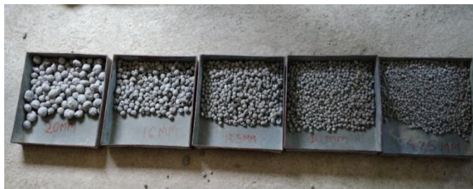
Fig 3. Segregation of aggregate

After curing, they were segregated into fine and coarse aggregates based on size of pellets as shown in Figure. The aggregates having size less than 4.75 mm were sieved as fine aggregates and size more than 4.75 mm were sieved as coarse aggregate. From them 20 mm size coarse aggregates were sieved separately to use them as coarse aggregates.