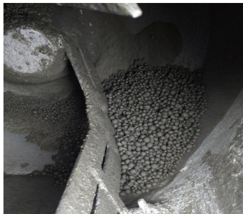
Fig 1. Preparation of aggregate

GGBS and Ordinary Portland cement was mixed into the ordinary concrete mixer. Those proportions were thoroughly dry mixed in a concrete mixer. After dry mix in a mixer, water was sprinkled until the formation of GGBS aggregate. The contents were thoroughly mixed in concrete mixer until the formation of GGBS aggregate. This method of formation is called as pelletization.